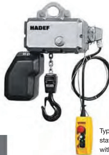
Type 62/05 S stationary hoist with suspension eye