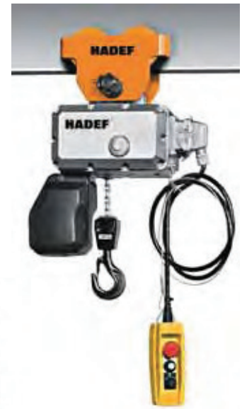
Type 62/05 R with push travel trolley